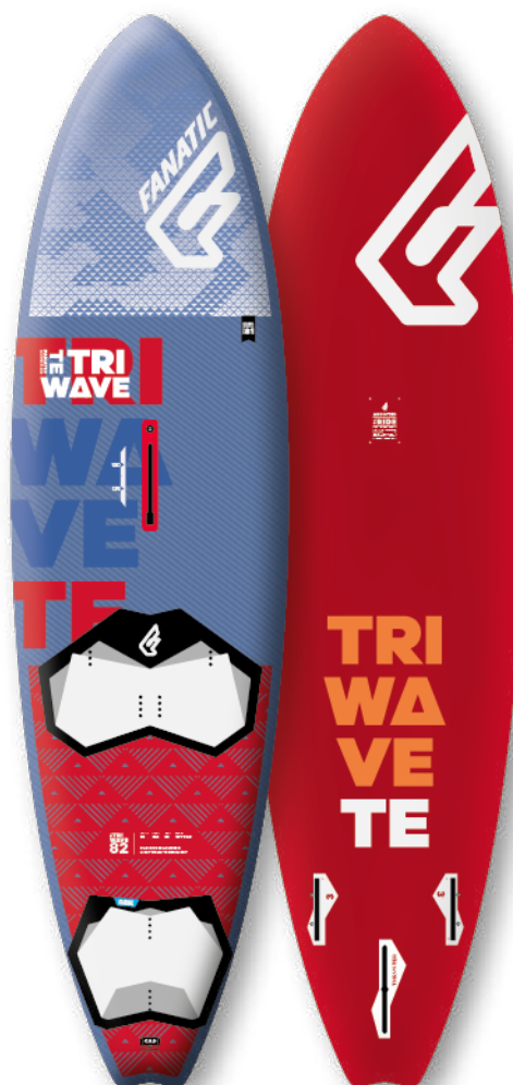
TRI WAVE TE 74 / 82 / 89 / 99