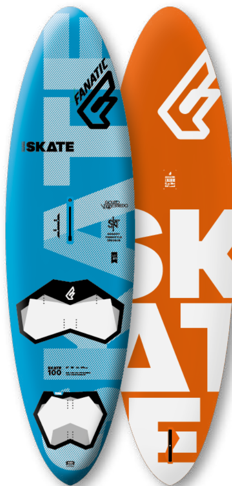
SKATE 100 / 110