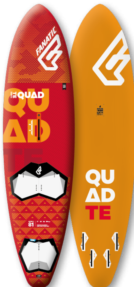
QUAD TE 69 / 75 / 81 / 90