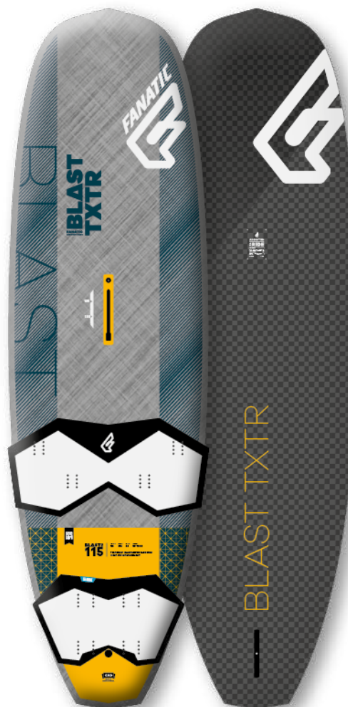
BLAST TXTR NEW! 100 / 115 / 130