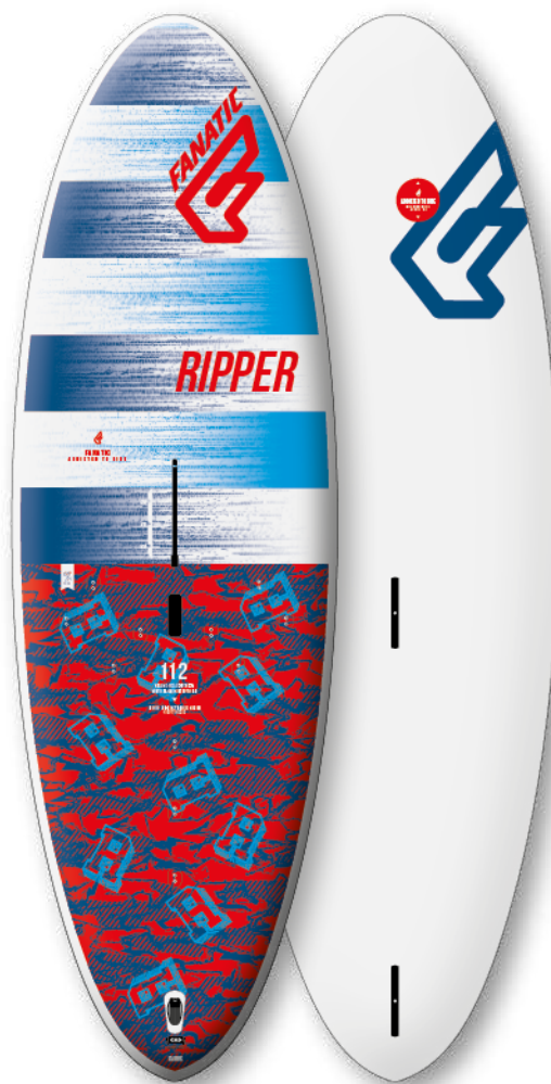
RIPPER UNCHANGED DESIGN 112 NEW!