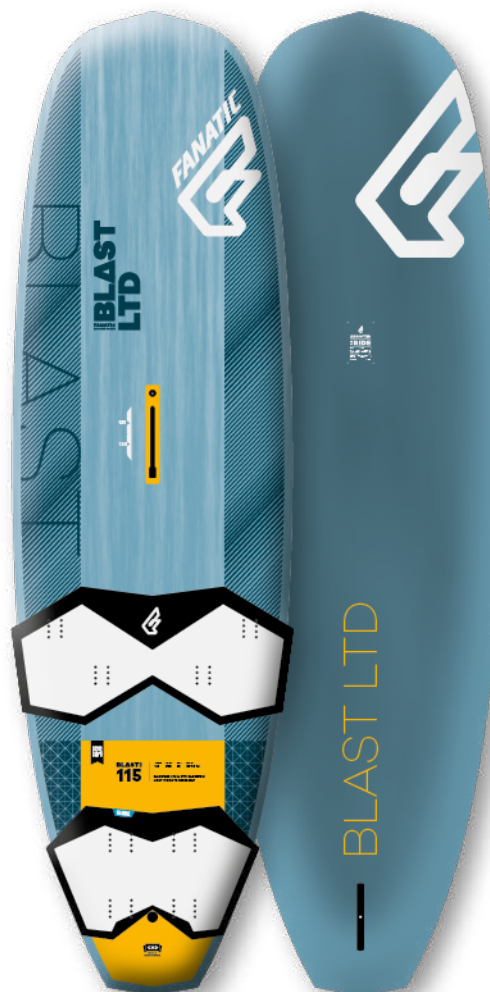
BLAST LTD NEW! 100 / 115 / 130