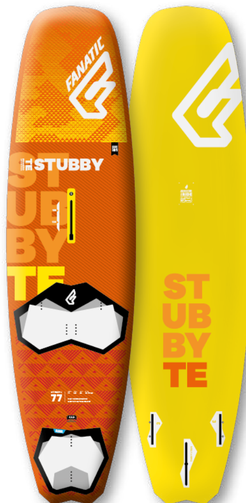
STUBBY TE 77 / 88 / 99 NEW!