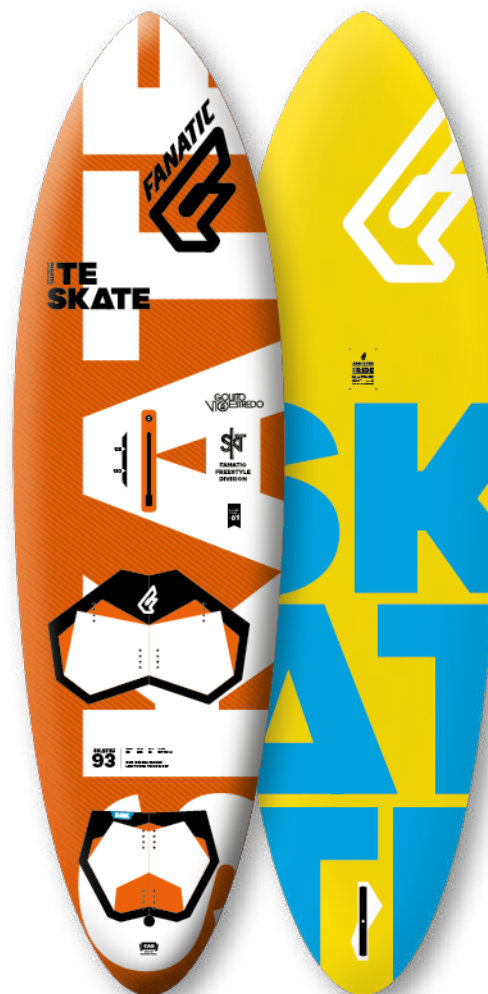
SKATE TE 86 / 93 NEW! / 100 / 108