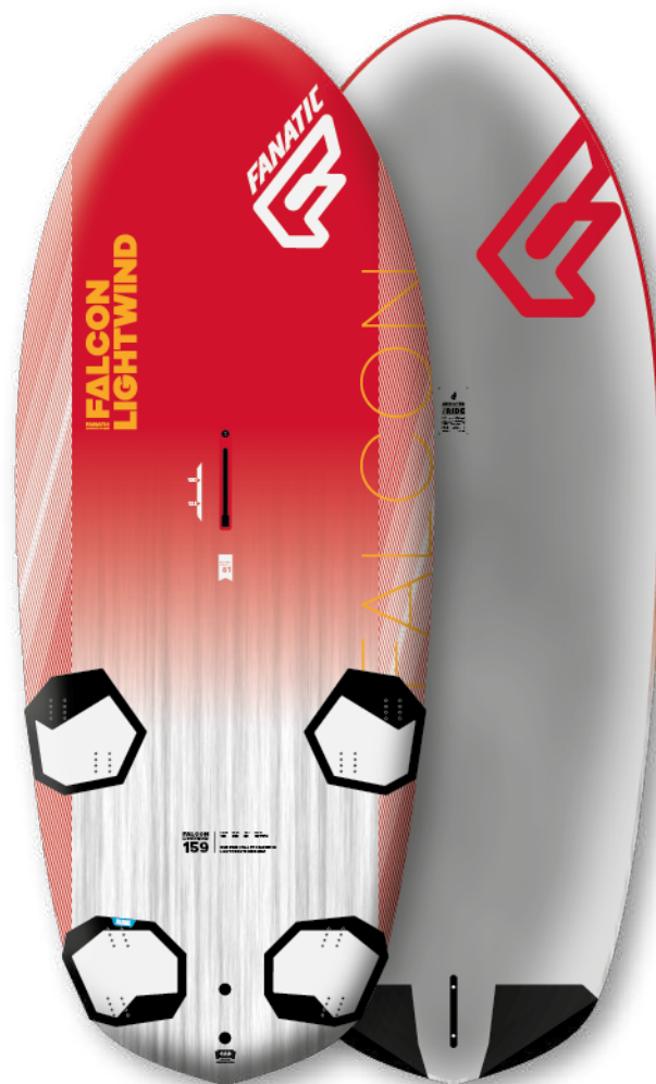
FALCON LIGHTWIND NEW! 159