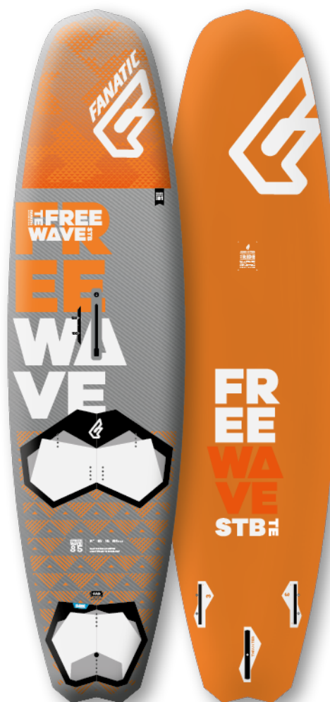
FREEWAVE STB TE NEW! 85 / 95 / 105